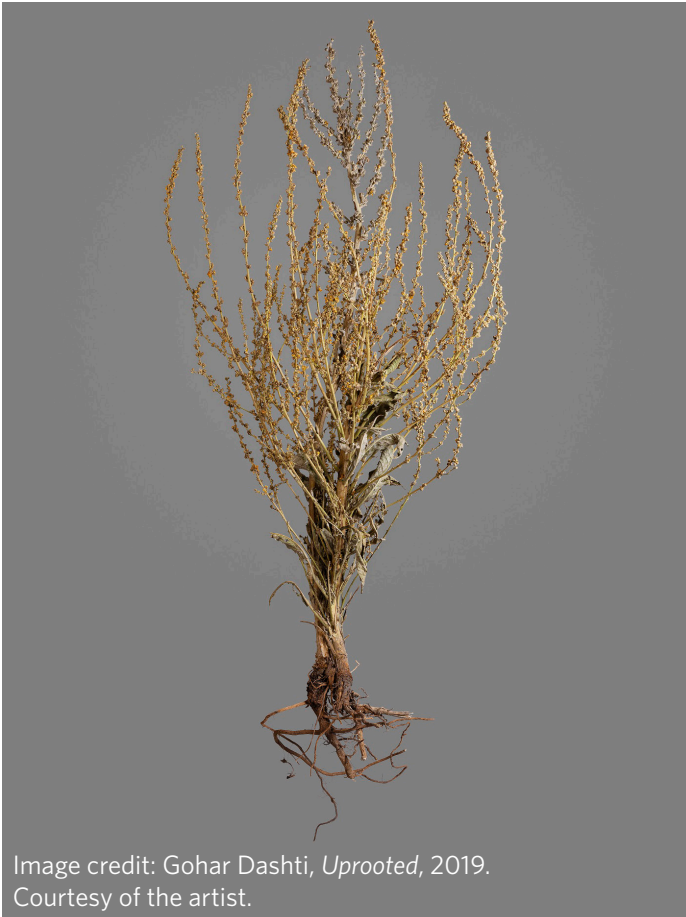
Image credit: Gohar Dashti, Uprooted , 2019. Courtesy of the artist.

Why do plants have roots? Can we see a plant's roots or are they hidden? Are root systems the same length as the height of a plant? Look at some of these photographs of Iranian plants that usually grow in the desert. These plants have been uprooted from the ground and photographed by Dashti. Please use these sheets to draw or collage your own roots and plants, based on the Salal plant and Nootka Rose, which grow in West Vancouver.