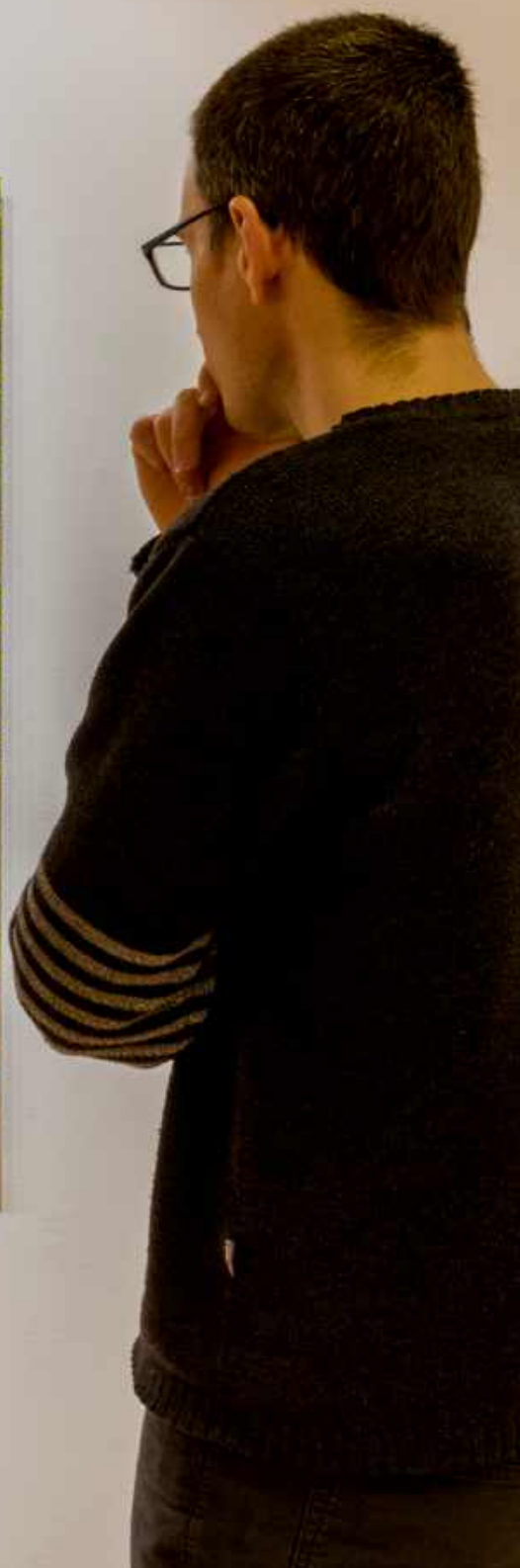
Rabbit Lane: Douglas Coupland, 2022